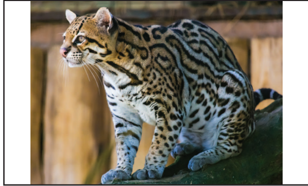
Figure 4: Table to show data collected from two phototrap surveys of ocelots ( Leopardus pardalis ) in a forested area of Yasuni National Park. Ocelots are predatory wild cats with unique coat markings